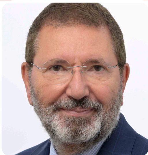
Ignazio Roberto Marino