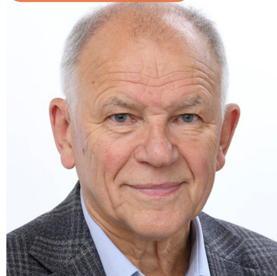
MEP Vytenis Povilas Andriukaitis

Andriukaitis (S&D), former WHO Special Envoy for the European region and former European Commissioner for Health and Food Safety